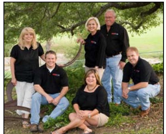
American Office Staff

Pre-register online at www.DanceADTS.com