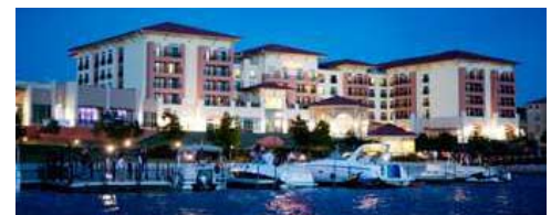
Hilton Bella Harbor Hotel on Lake Ray Hubbard in Rockwall, TX