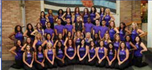
Stephen F. Austin State Univ