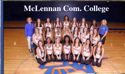
McLennan Com. College