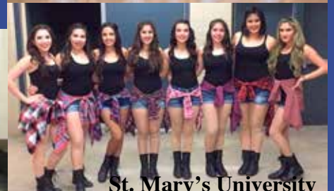
St. Mary's University