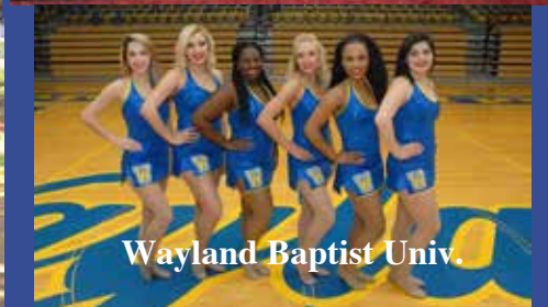
Wayland Baptist Univ.