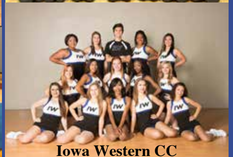
Iowa Western CC