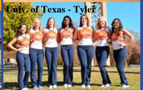
Univ. of Texas - Tyler