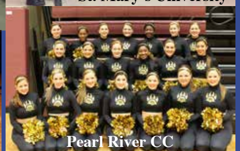
Pearl River CC