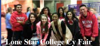
Lone Star College Cy Fair