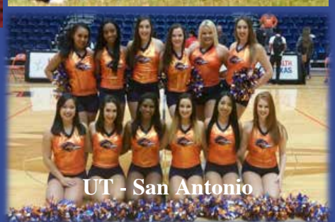
UT - San Antonio

Visit college teams and coaches on the Concourse of the Main Coliseum from 11:00 - 4:00 pm