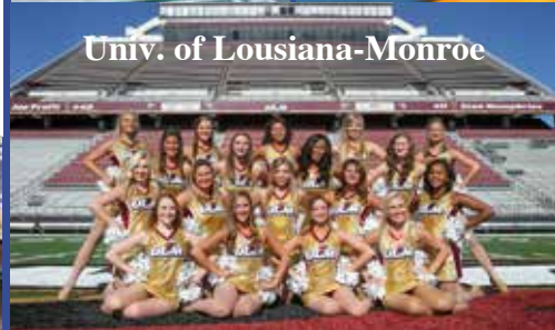
Univ. of Louisiana-Monroe