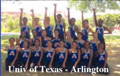
Univ of Texas - Arlington