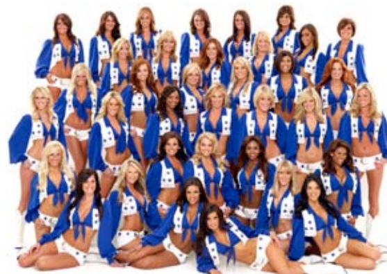
2008 Dallas Cowboys Cheerleaders 2009

The Dallas Cowboys Cheerleaders will be signing autographs from 4:00-6:00pm Saturday on the coliseum concourse.