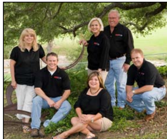
American Office Staff

Pre-register online at www.DanceADTS.com