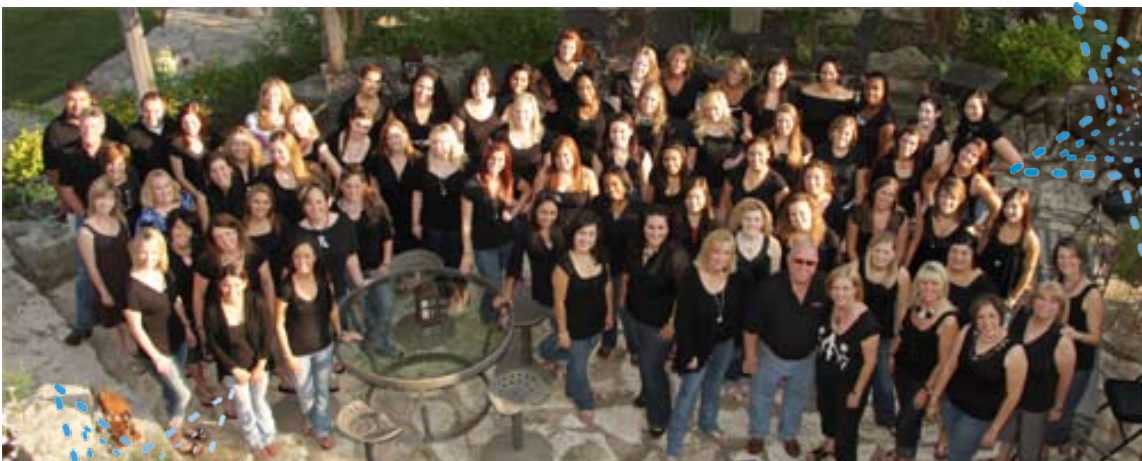
American Dance/Drill Team Staff

★ At all Team, Officer, Leadership and Private Camps, directors will receive a complimentary gift from American as well as a DVD of all Feature or Officer Dances, 2 music CD's, routine notes and Directors Handbook CD ★